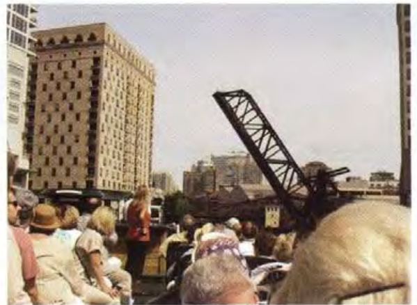
One of many drawbridges over the Chicago Rive as viewed from the top deck