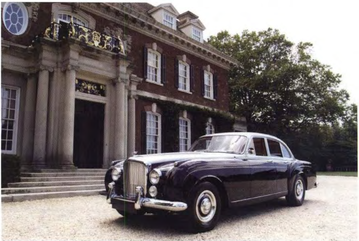
1962 Bentley Continental Flying Spur BC42LCZ at Old Westbury Gardens