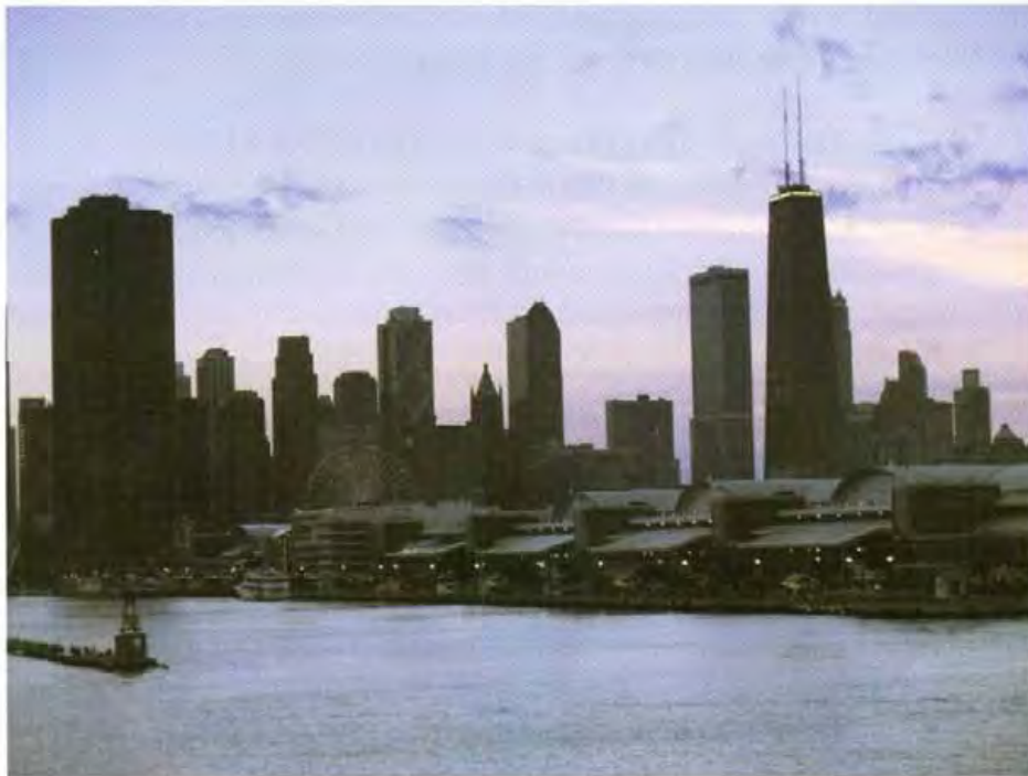
Chicago Skyline at Sunset