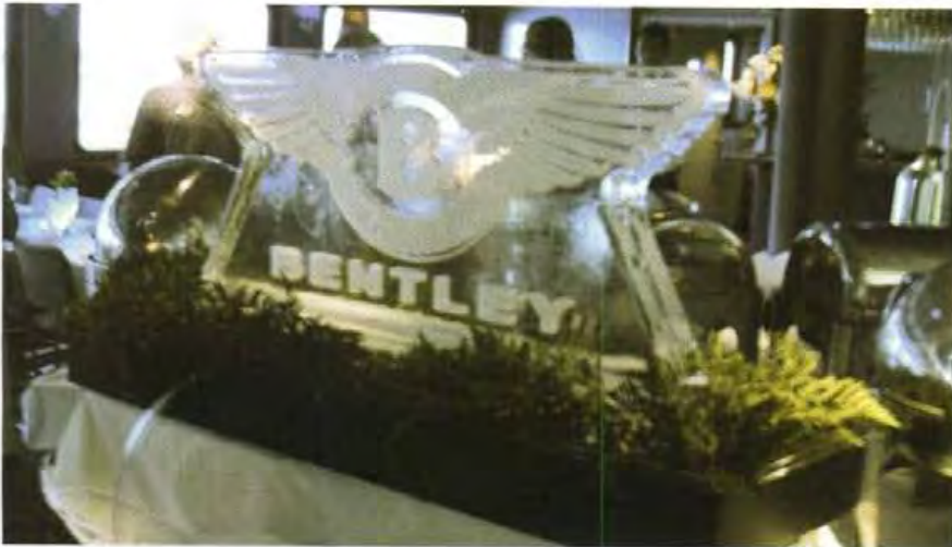
Bentley Ice Sculpture