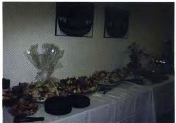
Buffet table of gourmet treats awaits members at the tech session