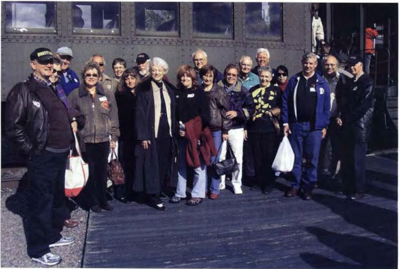
Atlantic Region members at Steamtown USA